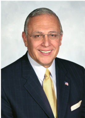
Chairman (AERTC) at SUNY, Stony Brook